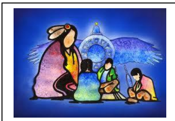
"Alexis Nakota Sioux Nation School's logo"

Teachers have been assessing student's reading and understanding what they have read through a tool called "Fountas and Pinnell". By using this tool teachers can determine how well your child is reading and understanding what she/he has read. Once a teacher has