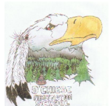
"O'Chiese First Nation School logo."