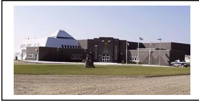
“Sunchild First Nation School”